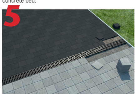
Pour 4" concrete around channel sides allowing for pavement detail (see section drawing above).