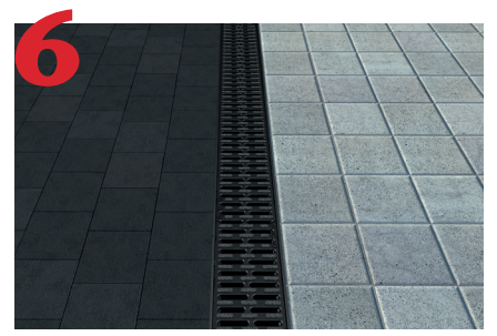
Finish pavement/pavers must be 1/8" higher than the grate

For pedestrian only applications, trench drain can be set directly on well compacted soil. For driveway applications, trench drain MUST be surrounded by 4" of concrete.