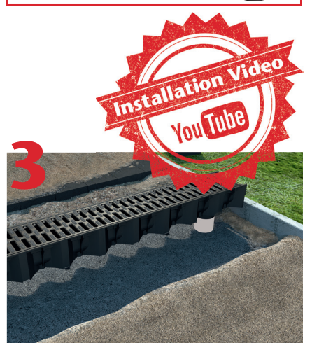
Knockout channel base for outlet and start to lay channels from outlet position.